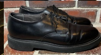
Tweed blazer, slacks, work oxfords