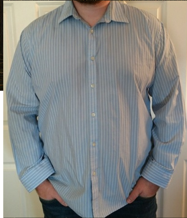
Light blue dress shirt